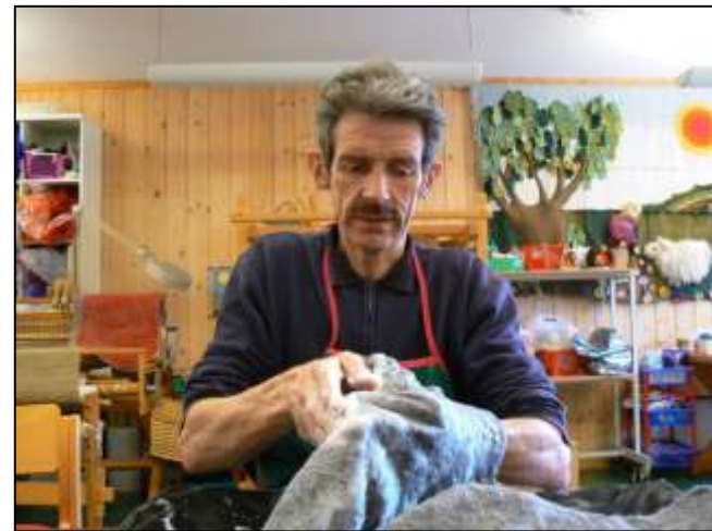
Illustrations of different courses at Eikholt (clockwise); mobility, ICT, hobby and communication.